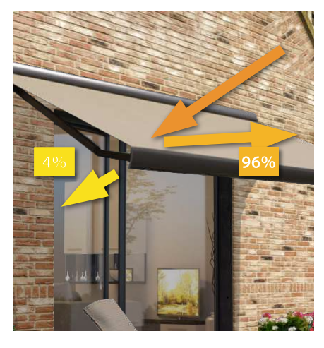
With an Awning fitted as little as 10% of solar heat is transmitted into the interior. With an external Screen this figure can be as low as 4%