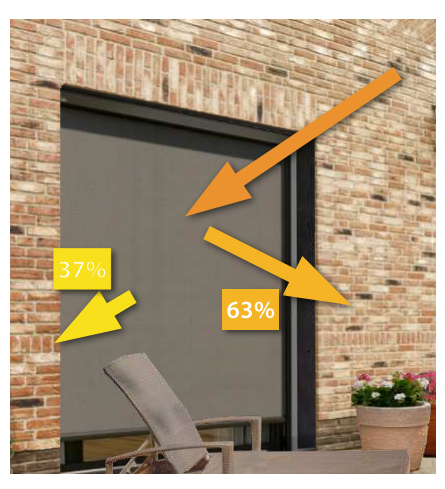
With an internal blind fitted, 37% of solar heat is transmitted into the interior.