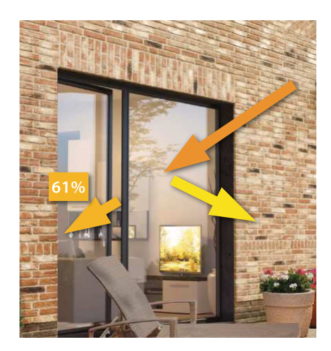
Without any window covering 61% of solar heat is transmitted into the interior.